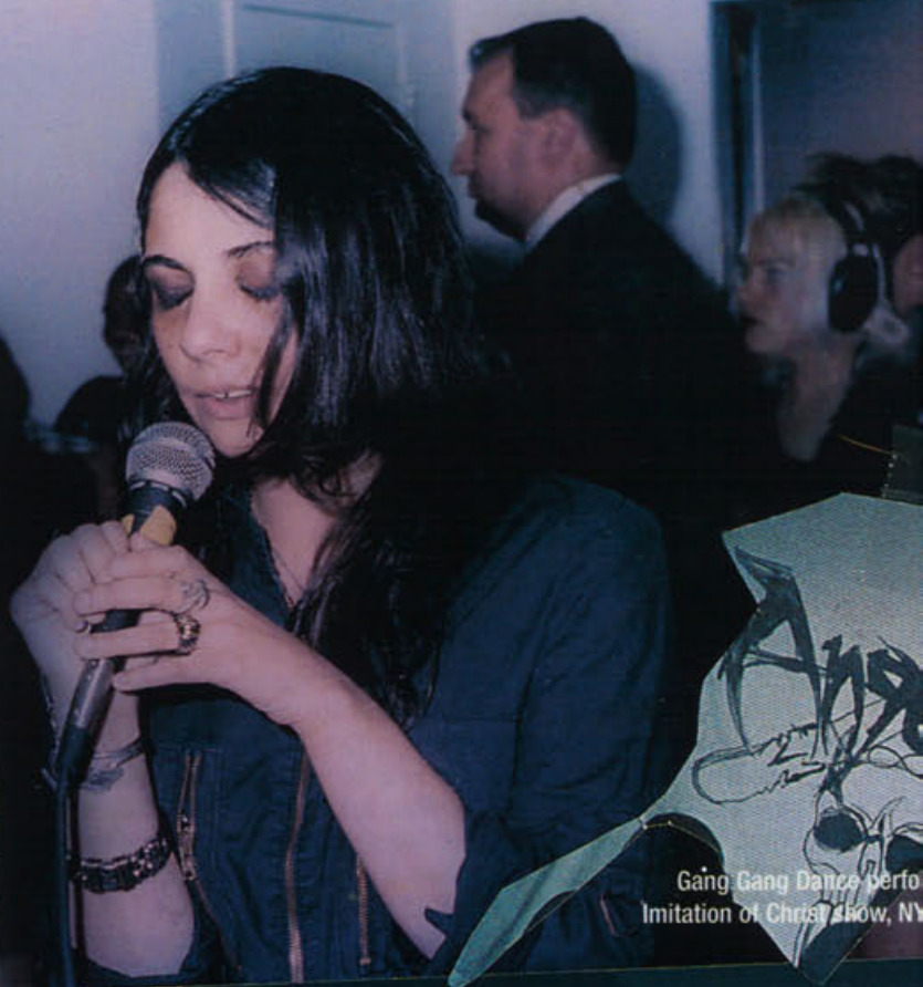
Gang Gang Dance performance, Imitation of Christ show, NY