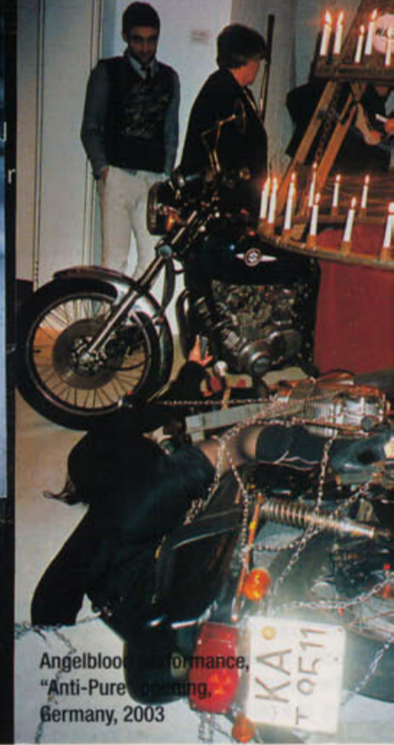
Angelblood performance, "Anti-Pure" opening, Germany, 2003