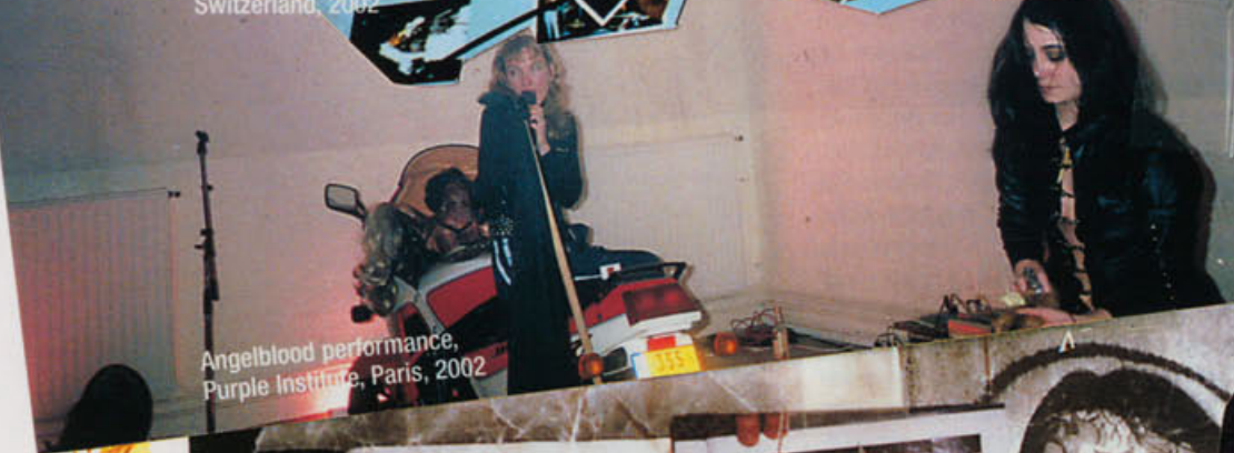
Angelblood performance, Purple Institute, Paris, 2002