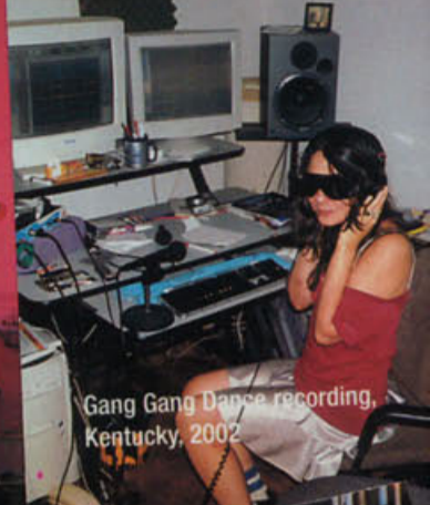
Gang Gang Dance recording, Kentucky, 2002