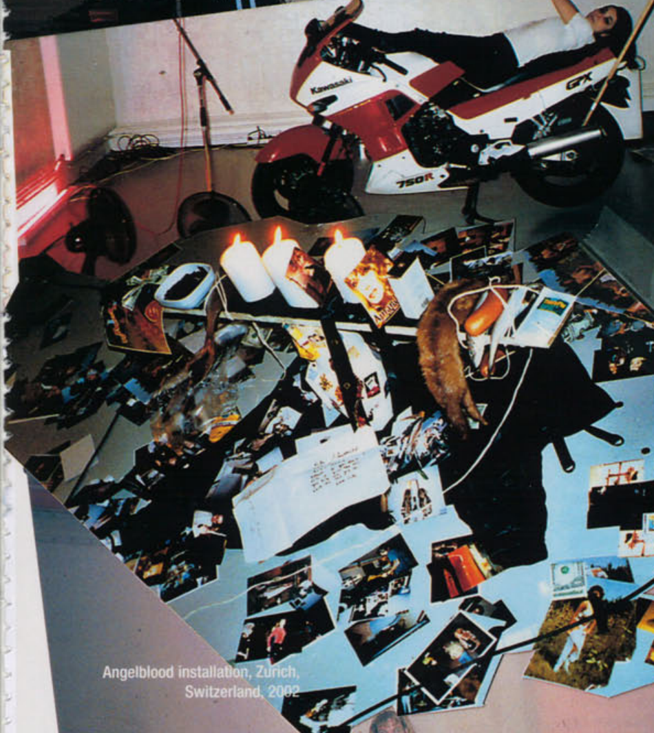
Angelblood installation, Zurich, Switzerland, 2002