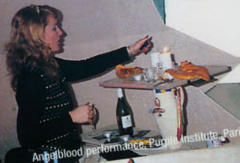
Angelblood performance, Purple Institute, Paris, 2002