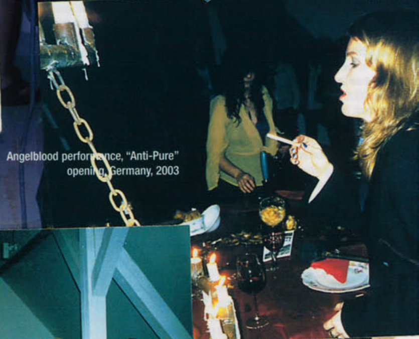
Angelblood performance, "Anti-Pure" opening, Germany, 2003