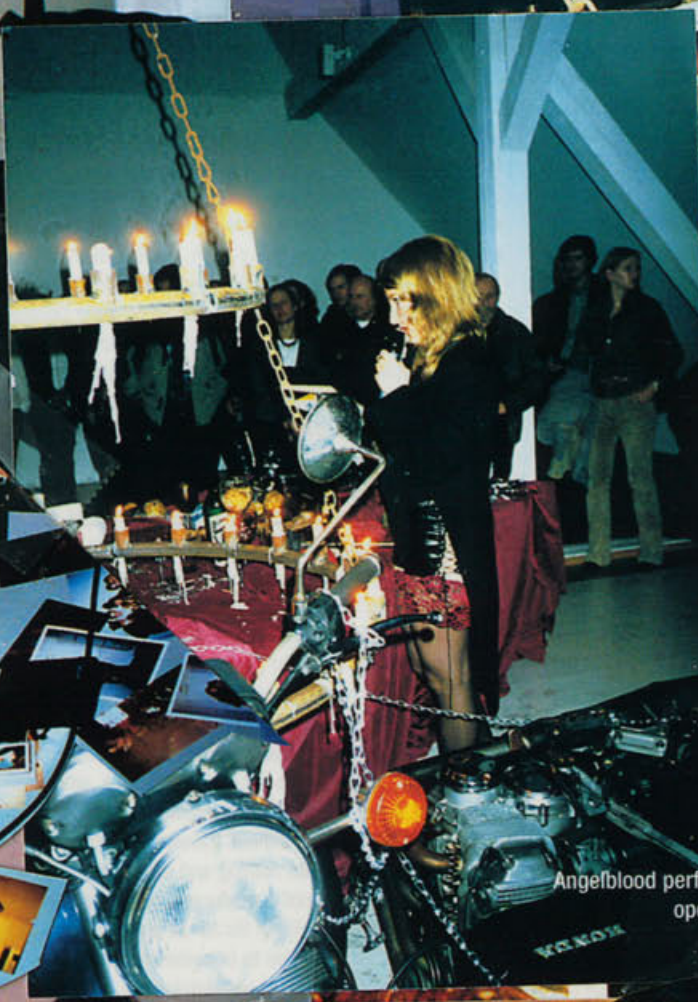
Angelblood performance, "Anti-Pure" opening, Germany, 2003