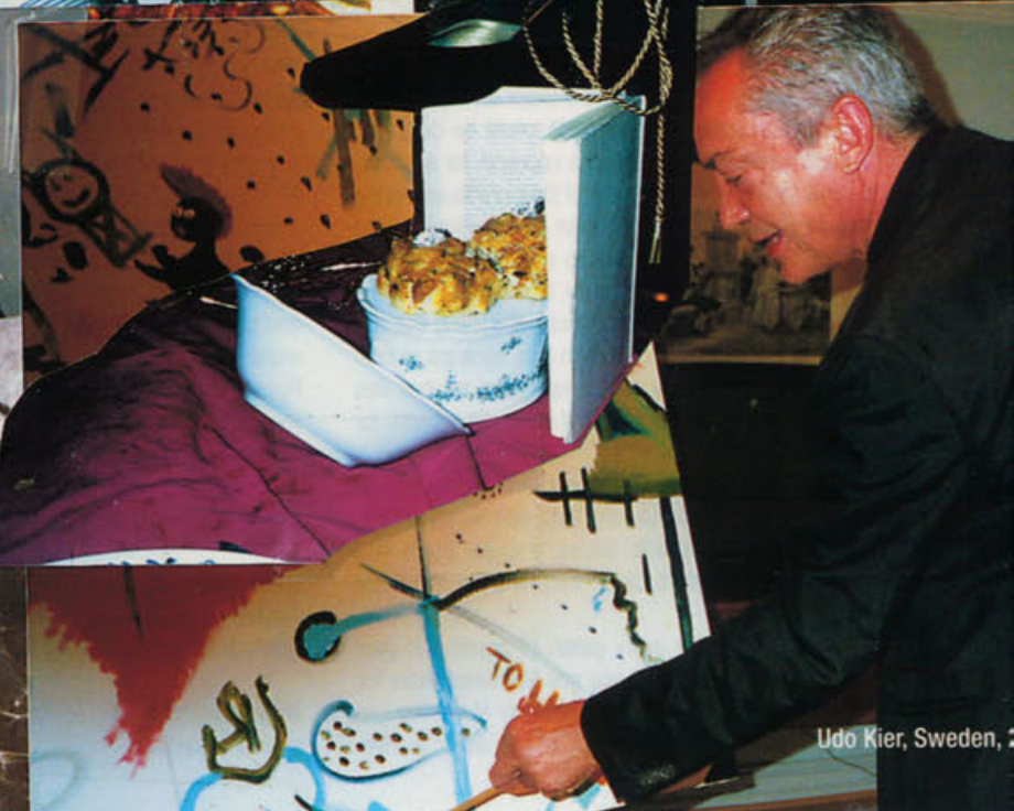
Udo Kier, Sweden, 2